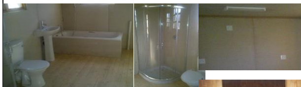
Examples of bathroom paneled with Nutec including: bath, toilet, basin and shower