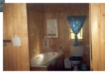
Example of electrical points and a bathroom paneled with Knotty Pine