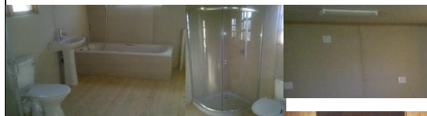
Examples of bathroom paneled with Nutec including: bath, toilet, basin and shower